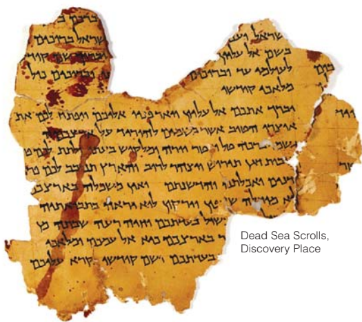
Dead Sea Scrolls, Discovery Place